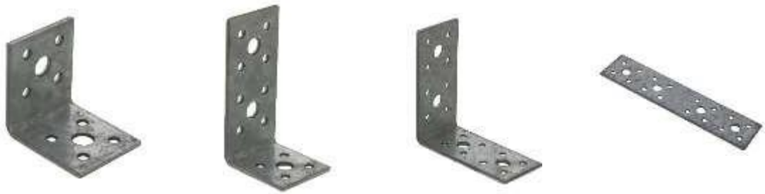
AB40/45x45 AB40/90x45 AB40/90x90 AB40/175 Flat