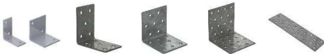
AP/442 & AP/444